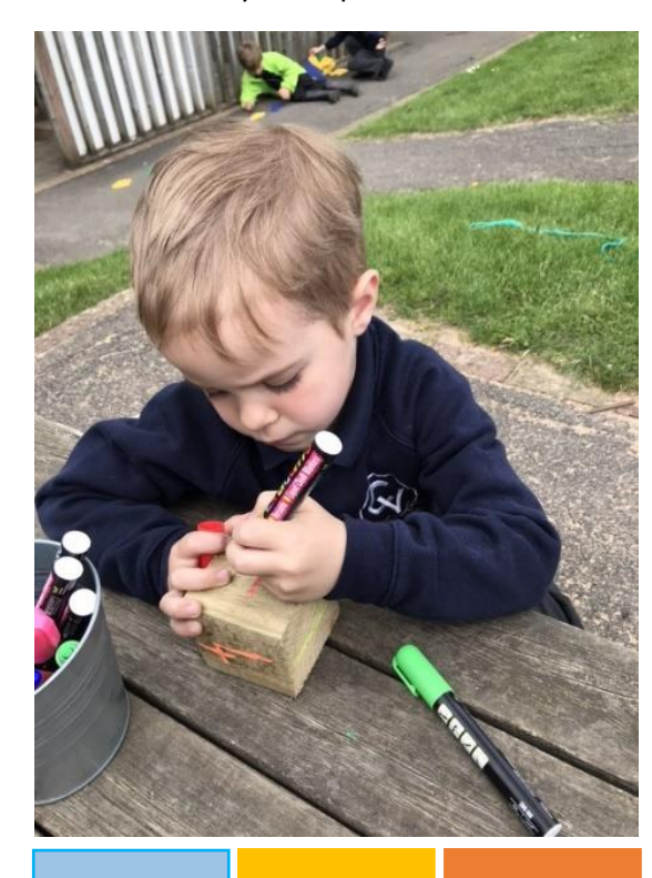
Maths is everywhere!

Abstract – with the foundations firmly laid, children move to an abstract approach using numbers and key concepts with confidence.