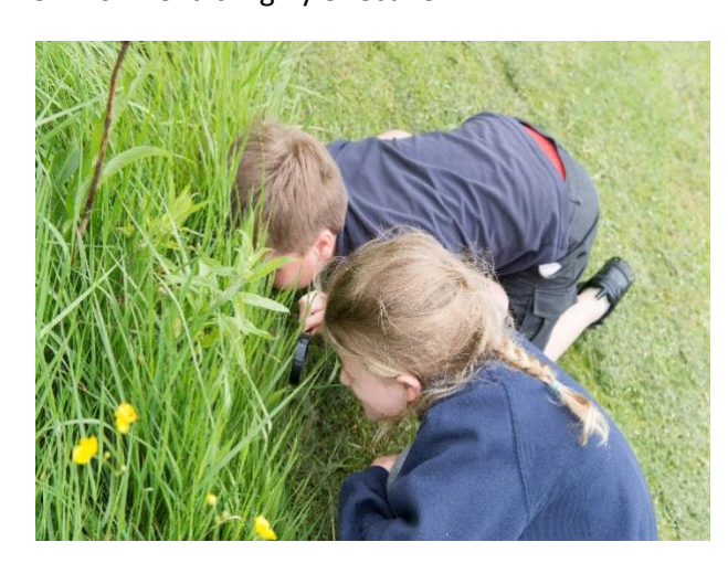
The 5-point scale measures:

The scales of well-being and involvement act as a measure of deep learning. Using the scales has an empowering impact on ensuring our learning environment is highly effective.