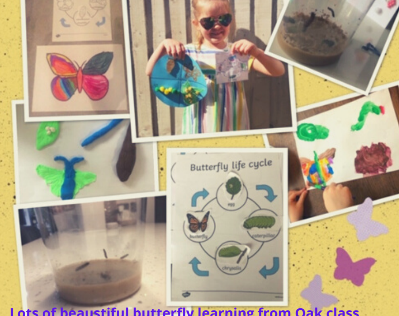
Lots of beaustiful butterfly learning from Oak class